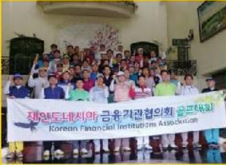
KEB HANA BANK GOLF GATHERING