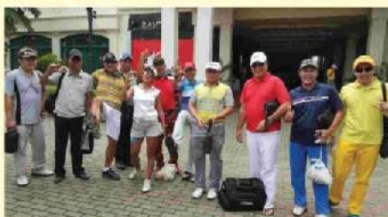
CANDAAN GROUP, 14 March 2017 GOBAR by CANDAAN GROUP at afternoon tee times by 14 members