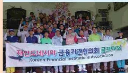
KEB HANA BANK, 4 March 2017 Followed by 41 players from Korean Financial Institutions Association