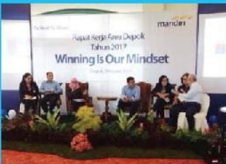
MANDIRI BANK MEETING