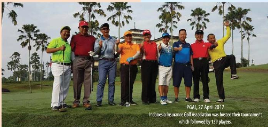
PGA I, 27 April 2017 Indonesia Insurance Golf Association was hosted their tournament which followed by 139 players.