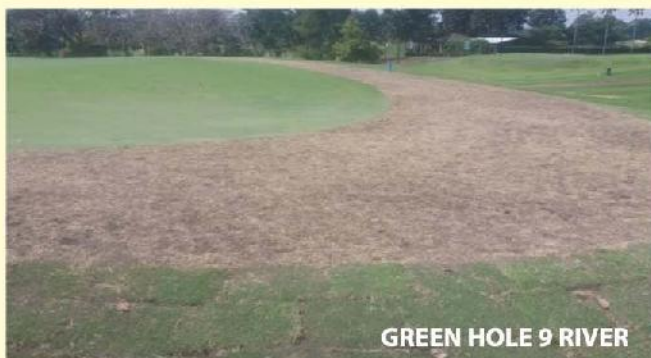
GREEN HOLE 9 RIVER