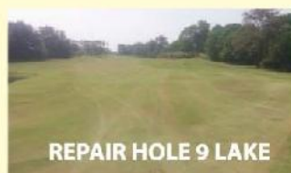
REPAIR HOLE 9 LAKE