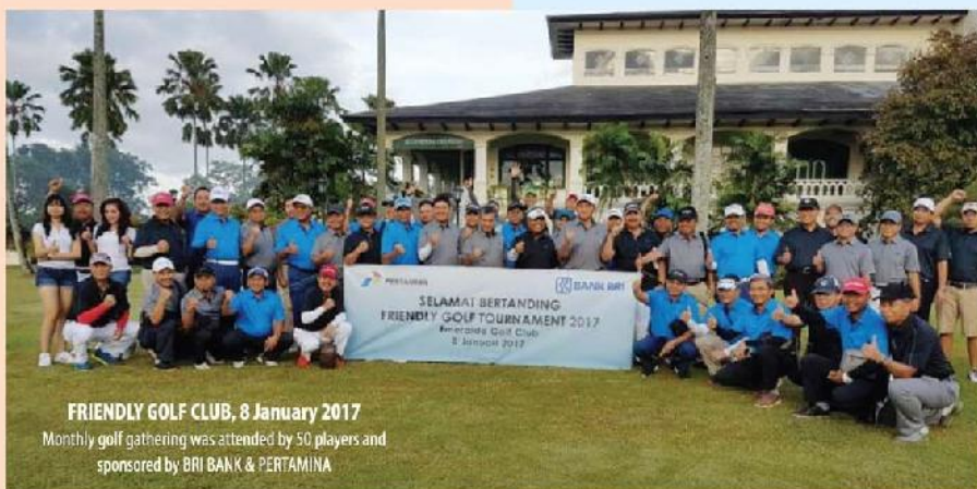
FRIENDLY GOLF CLUB, 8 January 2017 Monthly golf gathering was attended by 50 players and sponsored by BRI BANK & PERTAMINA