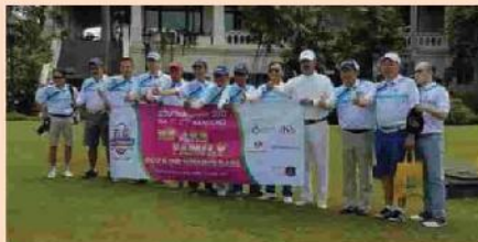
T&C TOURNAMENT, 20 April 2017 Tekstil & Cloth Group was hosted half day closed for 100 golfers.