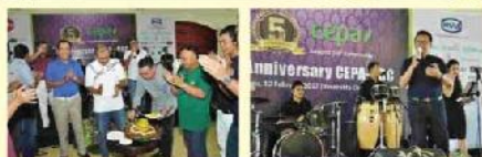
CEPA GROUP, 12 February 2017 Hosted the first CEPA tournament in 2017 which was succeeded follow by 150 players