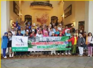
KGS BRI GOLF GATHERING