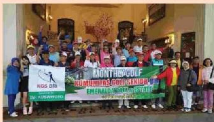
KGS BRI, 14 February 2017 Golf gathering which was followed by 47 players by BRI Bank